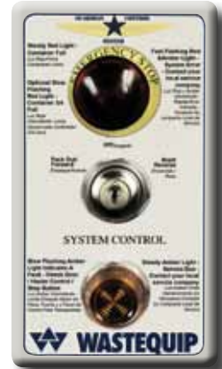
24 volt Guardian control system is UL listed