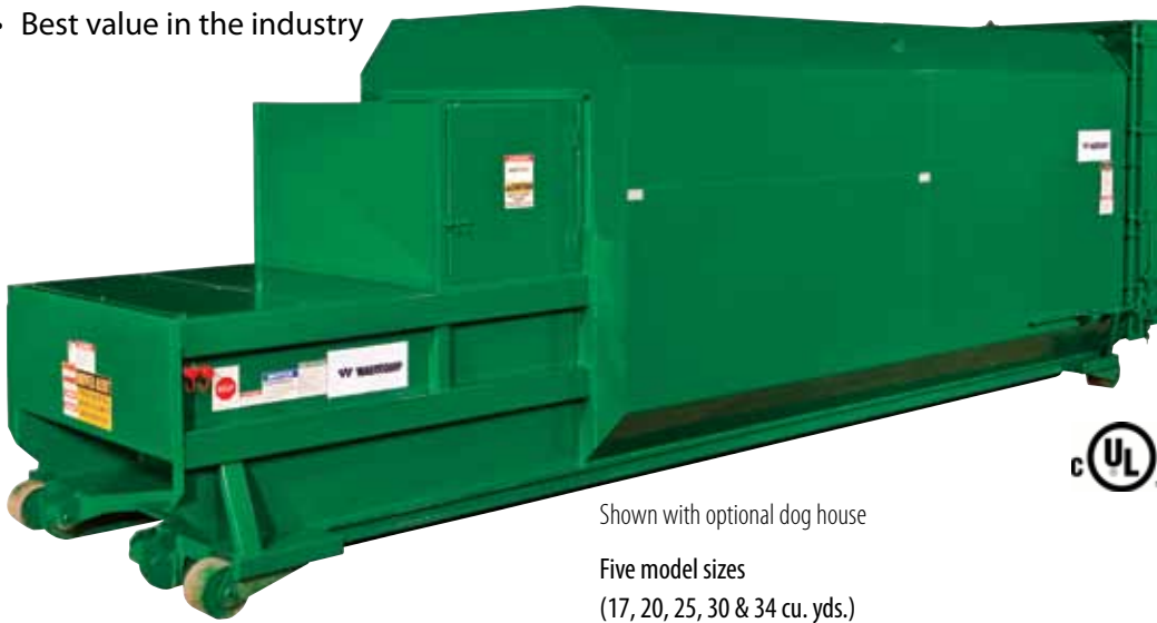
Shown with optional dog house

Five model sizes (17, 20, 25, 30 & 34 cu. yds.)