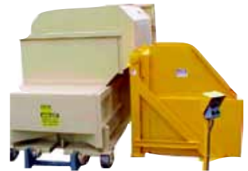
Compactor with optional cart dumper