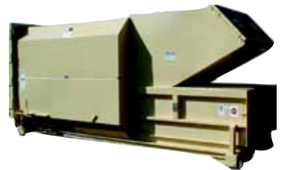
Compactor with plastic doors